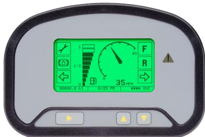
■ Curtis CAN, LED controller with EMC and water-dust prevention.