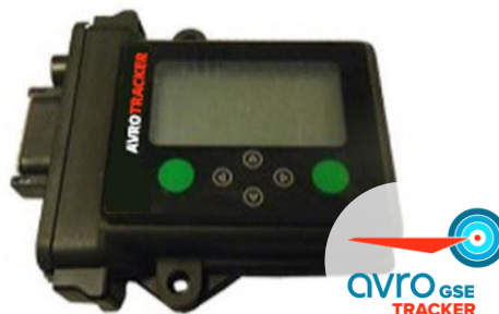
■ Onboard telematics with compliance and access control.