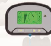
LED controller with EMC and water-dust prevention.

AIRCRAFT GROUND SUPPORT SALES AND SERVICE